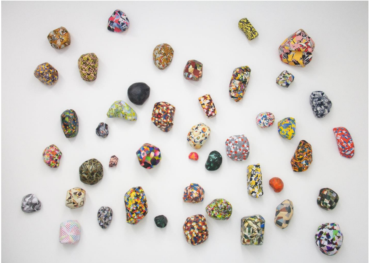
Collage Rock Wall, 2023

Unique Sizing, Rigid polyurethane foam, plaster, printed vinyl, UV matte varnish