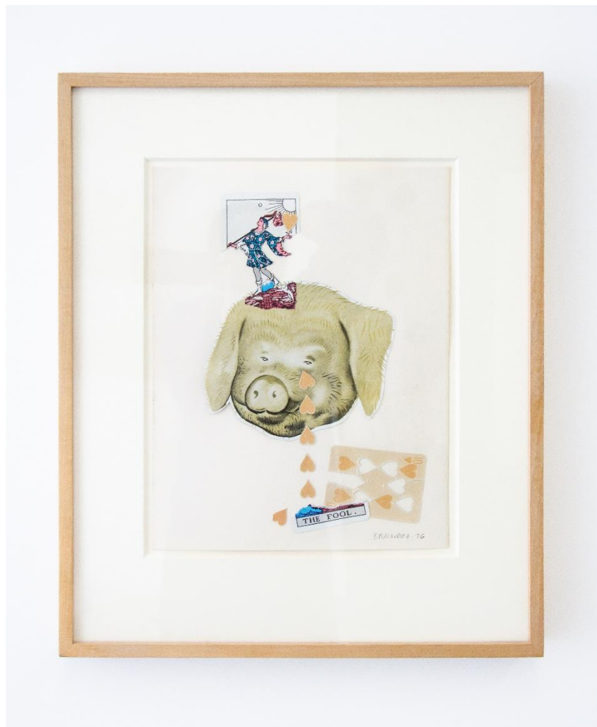
Joe Brainard Untitled (The Fool) 1976 Mixed media collage