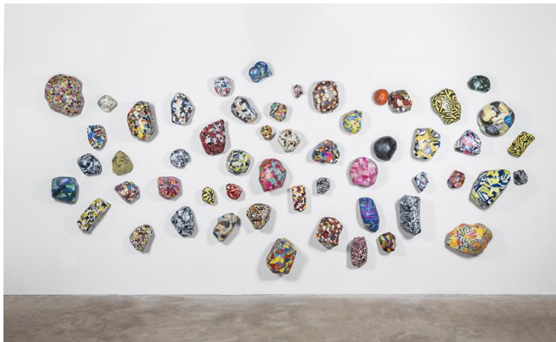
Ray Beldner, Collage Rock Wall , 2022, Mixed media, Various sizes.