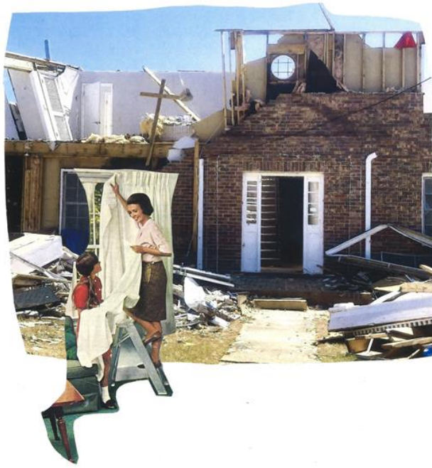
Sharon Shapiro, Drawing Drapes , 2022, collage on paper, 11 x 12 in.