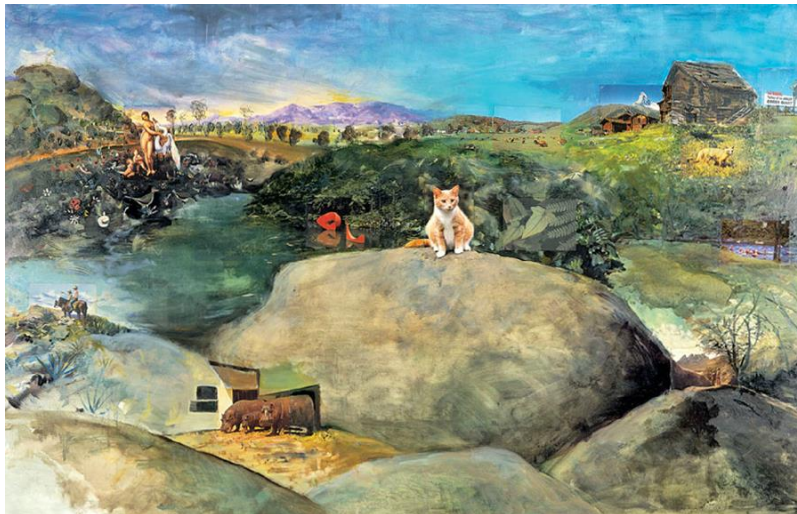
William Wegman, Cat on a Rock , 2005. Oil and found postcards on panel, 46 x 66 in.