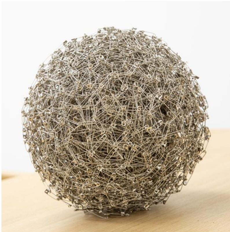
Tamiko Kawata, Silver Sphere , 2014, steel safety pins and nickel plating, 11 x 11 inches.

Opening Reception: Saturday, January 14, 2023 | 6-8 pm