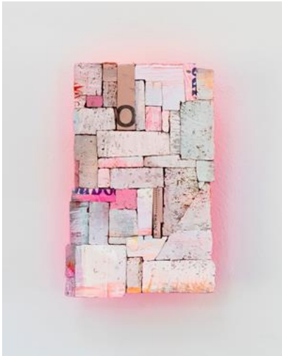
Joan Grubin, Detritus #50 , 2015, Acrylic on pressed wood, 5 x 3 inches.

from Tulsa in 1960 and gained early recognition with his first solo exhibition in 1965. Over the next decade he exhibited regularly and his work was included in numerous museum exhibitions in the United States and abroad. His works are in the permanent collections of the Metropolitan Museum of Art, the Museum of Modern Art, the Whitney Museum of American Art, Berkeley Art Museum among many others. Brainard gradually stopped making and exhibiting art in his mid-30s and devoted much of his time to reading thereafter.