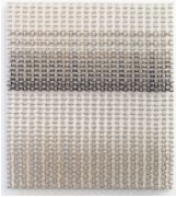
Tamiko Kawata Permutation 11, 2018 Safety pin, Acrylic on MDF board 33.75h x 32w x 1d in TAMK090