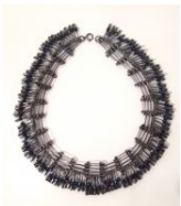
Tamiko Kawata Morning Dew Necklace 1 , 1999 Swarovski Peacock beads, Japanese safety pins (black fused) with silver clasp 1.50h x 15.50w in TAMK011