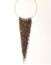
Tamiko Kawata Waterfall (black and brass) , 2015 Black and brass safety pins with gold hoop 10.50h x 16w in TAMK021