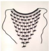
Tamiko Kawata Lacy Bib Necklace , 1999 Japanese safety pins (black fused) wood beads on black cord 7.75h x 7.50w in TAMK013