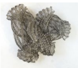
Tamiko Kawata Unknown small, 2018 Safety Pins 10h x 17w x 14d in TAMK070