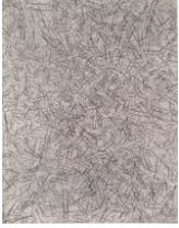
Tamiko Kawata Clips - 4 Black , 2010 conte crayon rubbing on tracing paper 12h x 9w in TAMK057