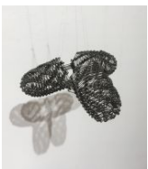
Tamiko Kawata Three Wings (small) , 2016 Safety pin/No. 2 4h x 8w x 8d in TAMK095