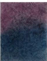
Tamiko Kawata Clips C-2 Purple Blue, 2010 conte crayon rubbing on tracing paper 12h x 9w in TAMK058