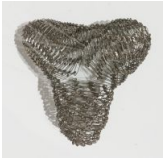
Tamiko Kawata Three Wings (large) , 2016 Black safety pin/No. 0 7h x 7w x 7d in TAMK098