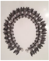
Tamiko Kawata Sunflower Necklace , 1999 Japanese safety pins (stainless steel, electronic treated-black finished) with stainless steel clasp 2h x 17w in TAMK014