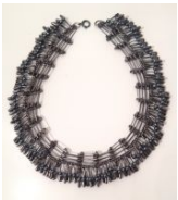
Tamiko Kawata Morning Dew Necklace 2 , 1999 Hematite beads, Japanese safety pins (black fused) with silver clasp 1.50h x 15.50w in TAMK012