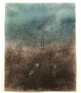
Tamiko Kawata Paper Clip Rubbing , 2011 Pastel rubbing on vellum 13.50h x 11w in Framed: 16.75h x 13.75w in TAMK097