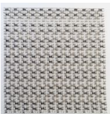
Tamiko Kawata Permutation 10, 2018 Safety pin on MDF Board 33.38h x 31.75w x 1d in TAMK068