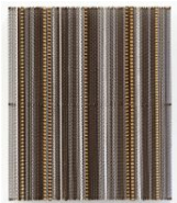
Tamiko Kawata CBM-3, 2018 Cardboard, acrylic 17h x 14.50w x 1.50d in TAMK075