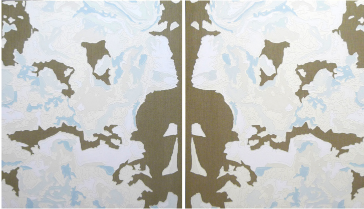
Blue Mandala Diptych I , 2013, acrylic relief on linen, 36 x 56 inches.

opening reception: Thursday, February 20, 6-8 p.m.