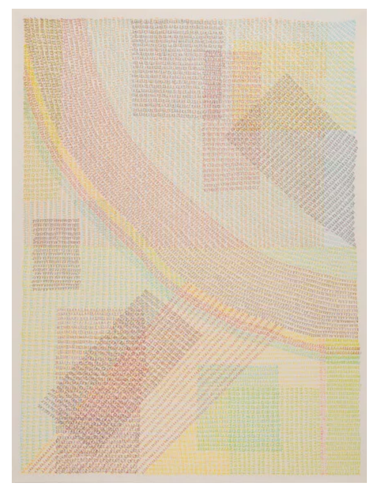
Lynnette Therese Sauer Untitled (layered meditation) 6, 2020 Garvey I Simon