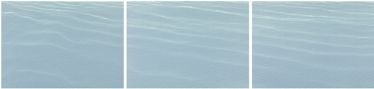
Strait, 2019, Linocut with hand coloring mounted on panel

A single line serves as the origin for Aspinwall’s liminal landscapes. She allows her hand to move instinctively, recording her inhales, exhales, adjustments, and shifts along the way. The subsequent lines are an attempt to follow the path of the original, proliferating into a sea of vibrations. Despite their shared design, the tonal variances in Strait and Flare emit contrasting energies. Whether tranquil or galvanic, these abstract horizons absorb the viewer with their immensity.