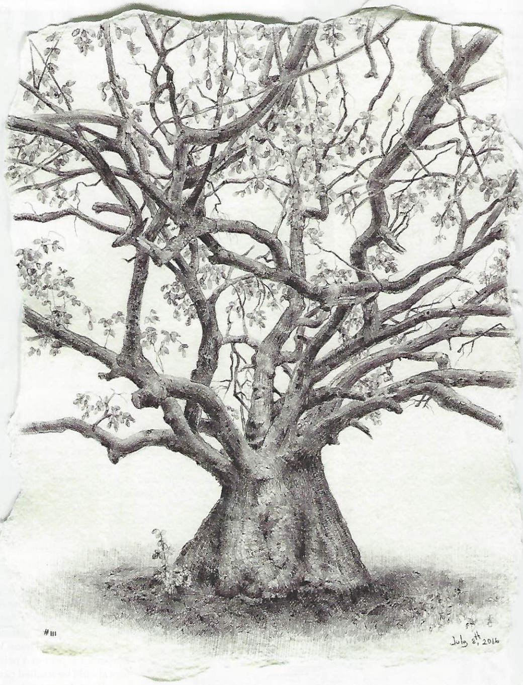
Secret Life of Trees 111, 8 July 2016, ballpoint pen on paper, 8 x 6 in., private collection