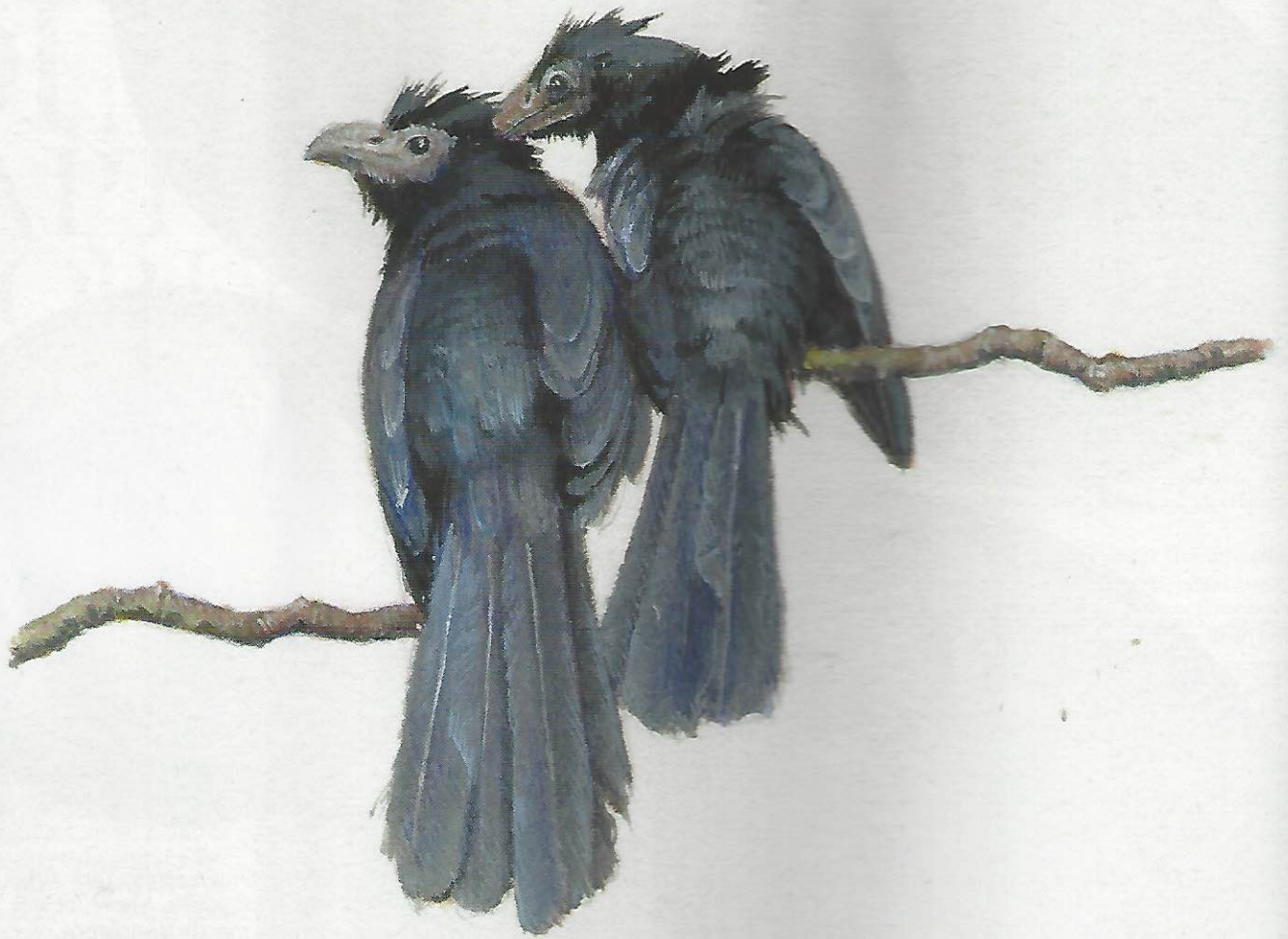
Bird by Bird: Two Blackbirds , 2018, watercolor and gouache on paper, 6 x 5 1/4 in., private collection

sky has put away her oils and other toxic materials. Instead she uses watercolor and gouache to depict birds ranging from the common pigeon to the exotic quetzal. Occasionally she brings her son to the Central Park Zoo so she can sketch from life.