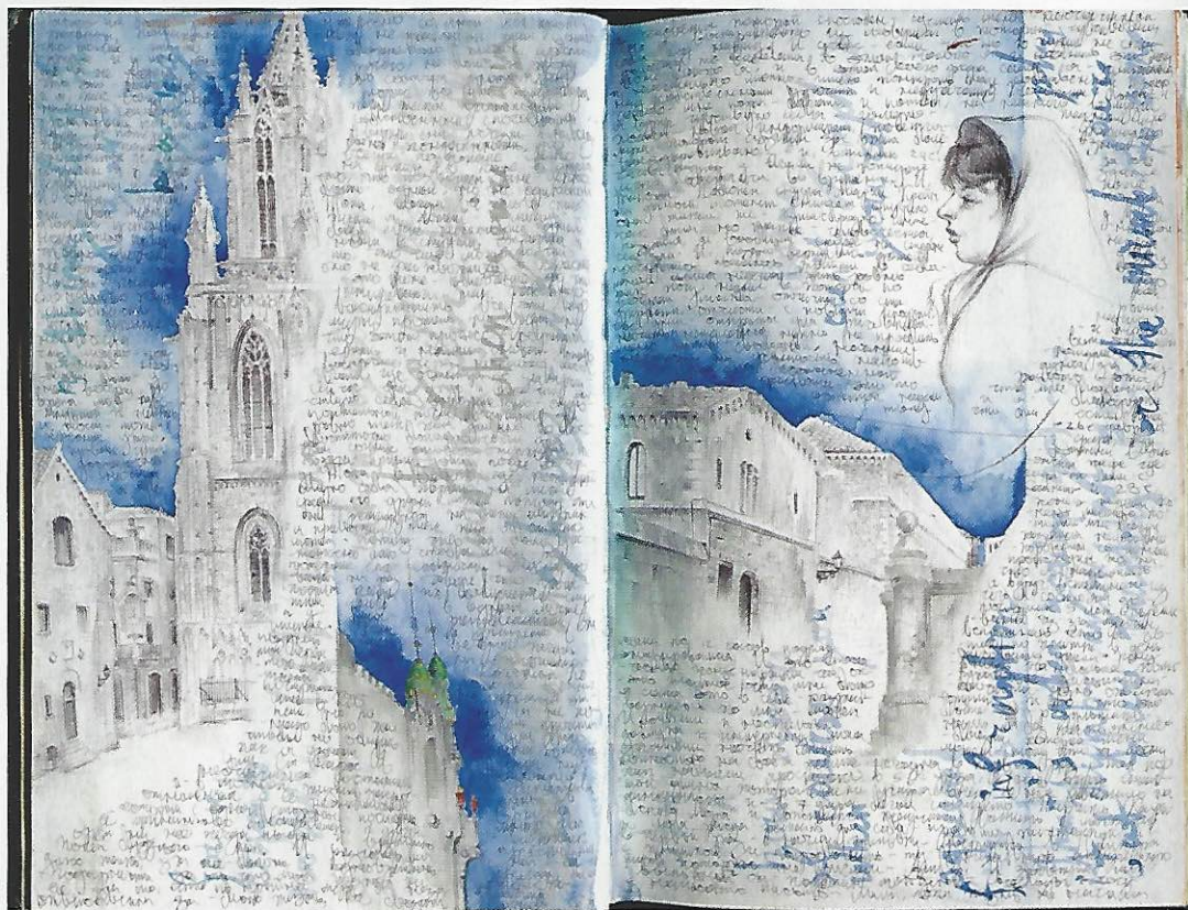
One of Dina Brodsky's sketchbooks from Barcelona, 2014, not for sale

For an ongoing series of tondo paintings on copper titled Cycling Guide to Lilliput , Brodsky consulted sketches from her latest excursion from Passau (Germany) to Prague. The results were well received during a show last spring at London's Pontone Gallery, and now