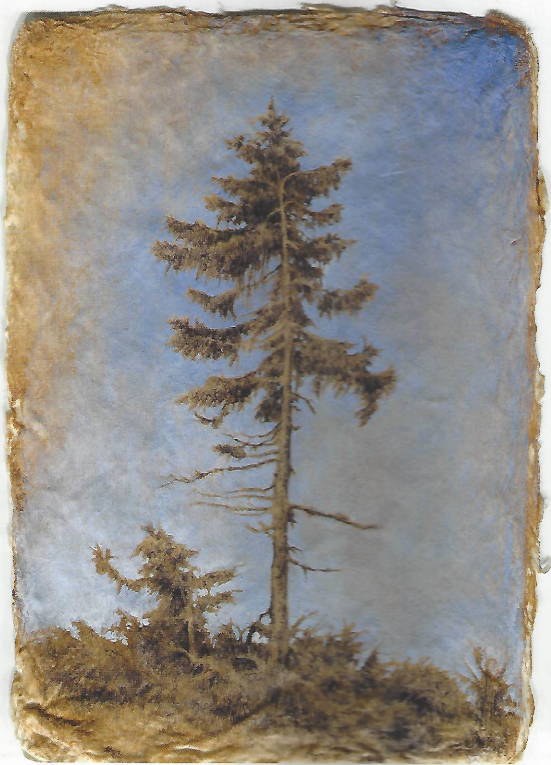
Secret Life of Trees 83, 10 April 2016, oil and ballpoint pen on paper, 7 x 5 in., private collection