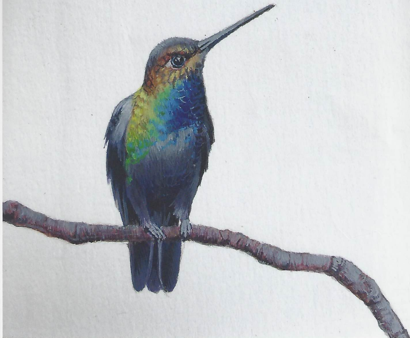
Bird by Bird: White-Tailed Hillstar, 2018, watercolor and gouache on paper, 5 1/2 x 4 3/4 in., Garvey|Simon, New York City