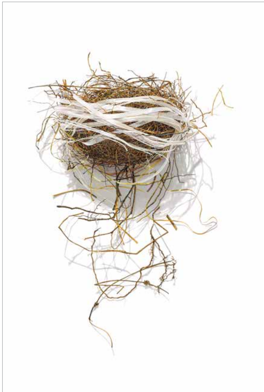
Bird Nest Series, No. 9 Year TK, colored pencil, dims TK.

DM: I dive right in. I start by doing a detailed contour line drawing on tracing paper. Using Saral transfer paper, I then transfer the drawing to Stonehenge 250-gsm paper.