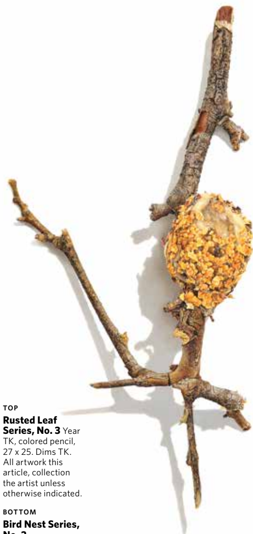
TOP Rusted Leaf Series, No. 3 Year TK, colored pencil, 27 x 25. Dims TK. All artwork this article, collection the artist unless otherwise indicated.