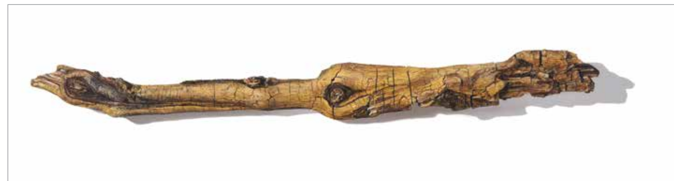
Stick Series, No. 1 , 2015, colored pencil, 14¾ x 29½. Collection TK.

“USING COLORED PENCILS IS ALL ABOUT PRESSURE AND SENSITIVITY—LEARNING HOW TO APPLY THE PRESSURE, HOW TO BLEND, HOW MUCH OF ONE COLOR GOES ON TOP OF ANOTHER.”