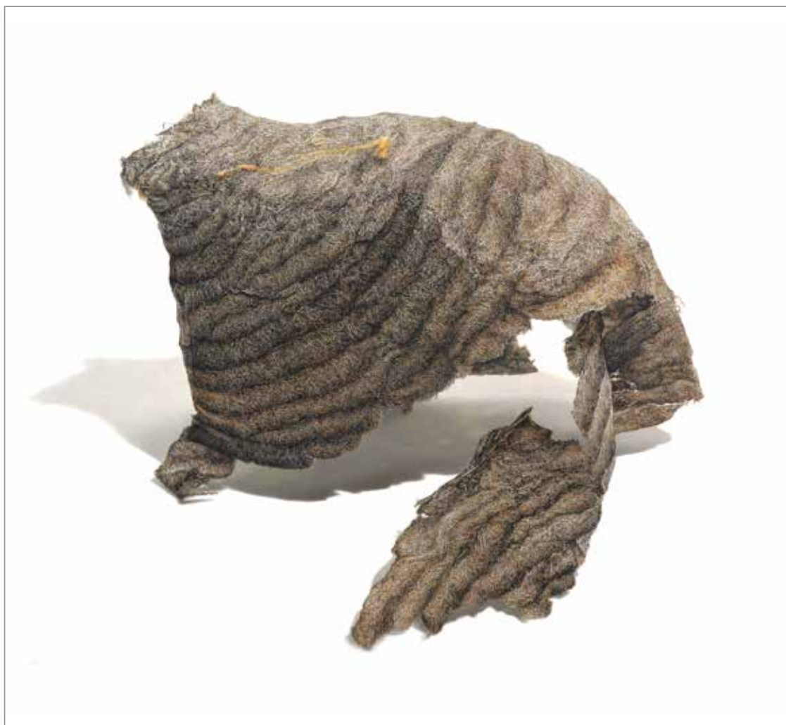
ABOVE RIGHT Mushroom Log Year TK, colored pencil, dims TK.