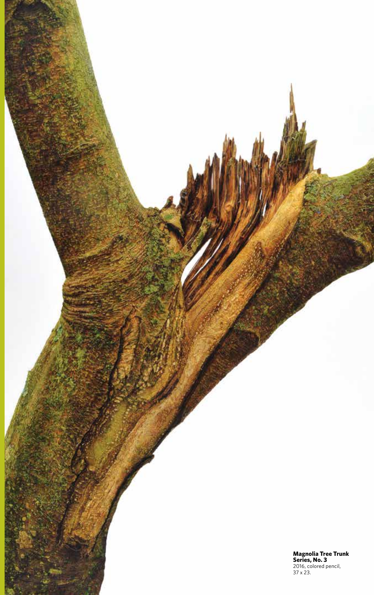
Magnolia Tree Trunk Series, No. 3 2016, colored pencil, 37 x 23.